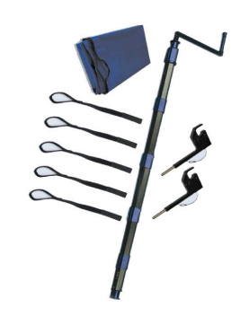
The Convertible Chair H-250