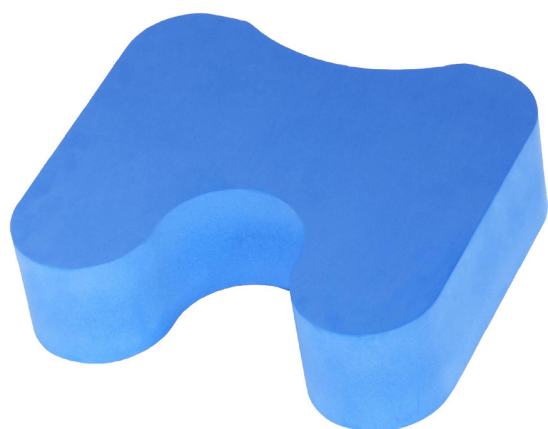
Alpha Footstool PM-8090