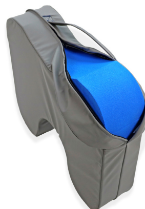
Alpha Footstool Cover PM-8091