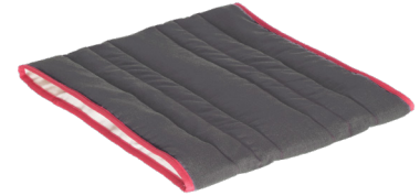
Alpha Chair Sliding Mat, tubular model / PM-2070