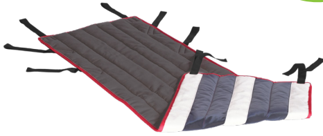
Alpha Chair Sliding Mat with fixation loops, open model / PM-2076