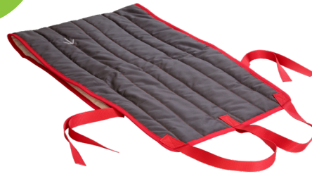
Alpha Chair Sliding Mat with 4 hand grips, open model / PM-2078